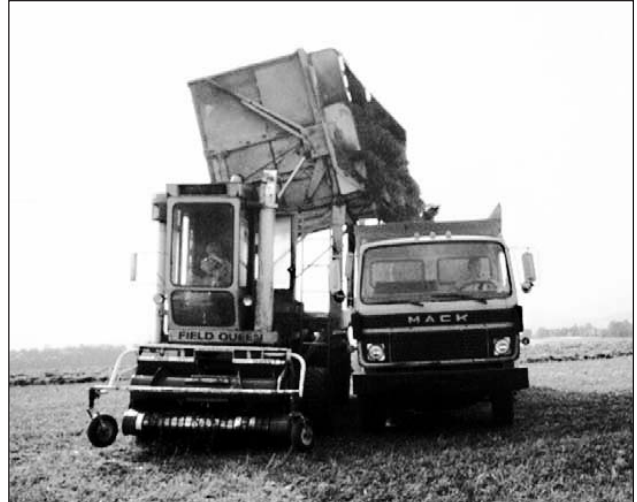
Production of silage has been relatively easy to mechanize.

Regardless of the amount of capital invested, the purchase and subsequent use of expensive silage-making equipment will not improve forage quality. Forages harvested at advanced stages of maturity will always be poor in quality. To make high-quality silage, producers always must start with high-quality forage.