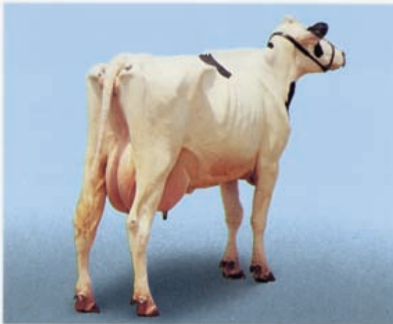
BCS = 1